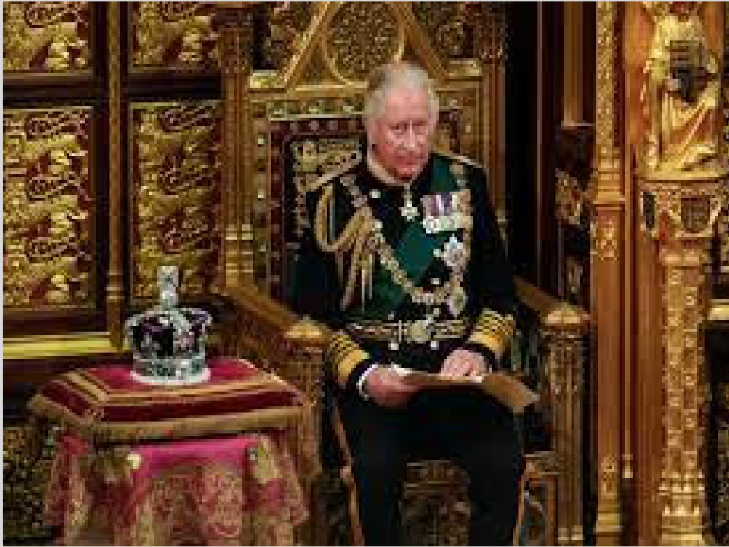
16 th Cousin